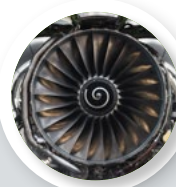
Control & monitoring of essential assets